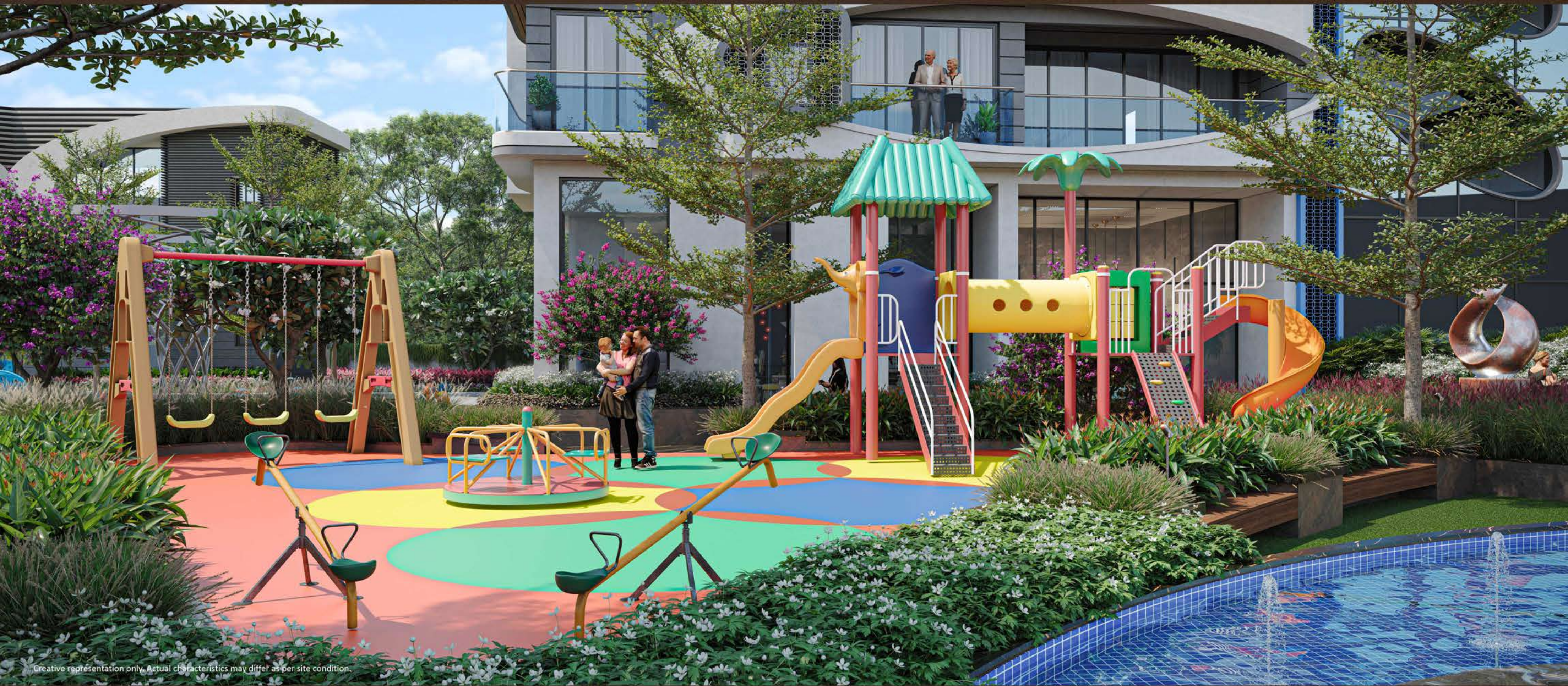
Creative representation only. Actual characteristics may differ as per site condition.