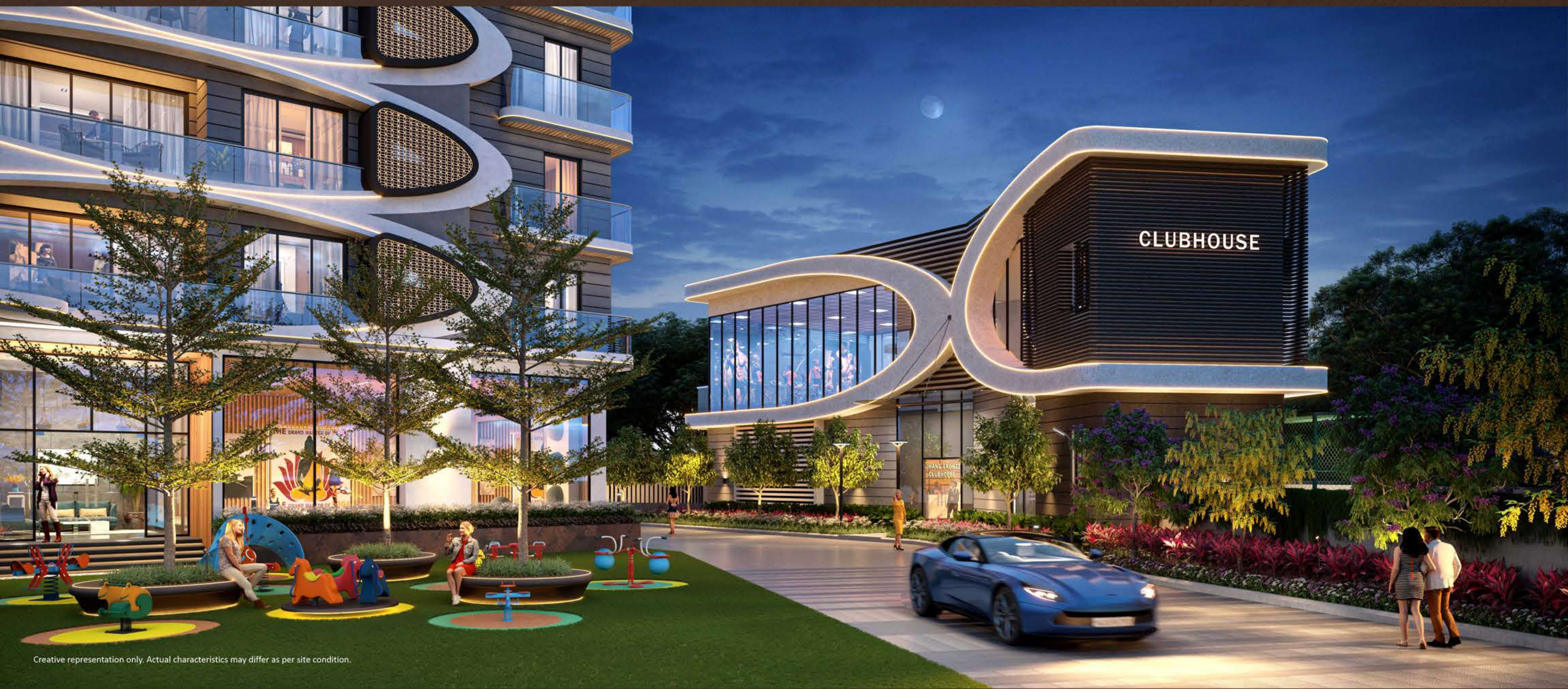
Creative representation only. Actual characteristics may differ as per site condition.