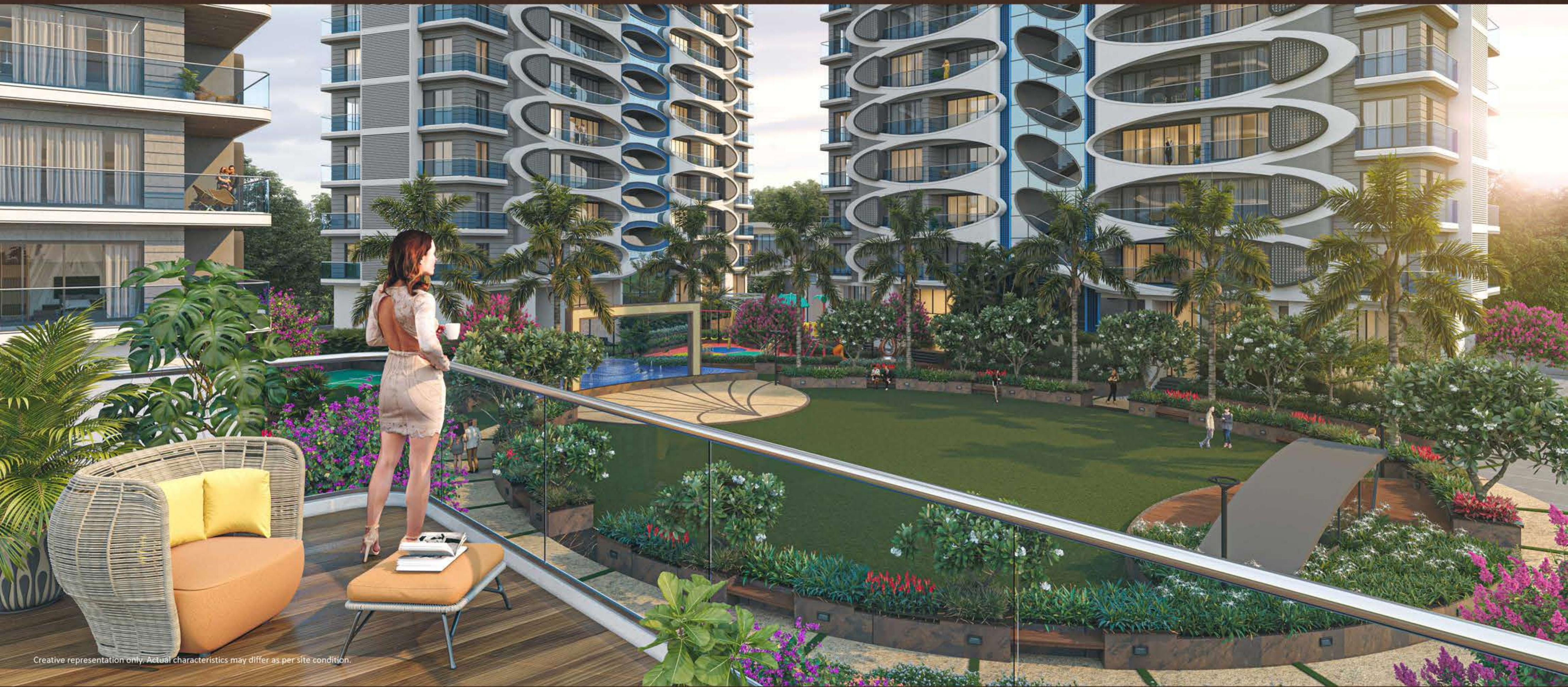
Creative representation only. Actual characteristics may differ as per site condition.