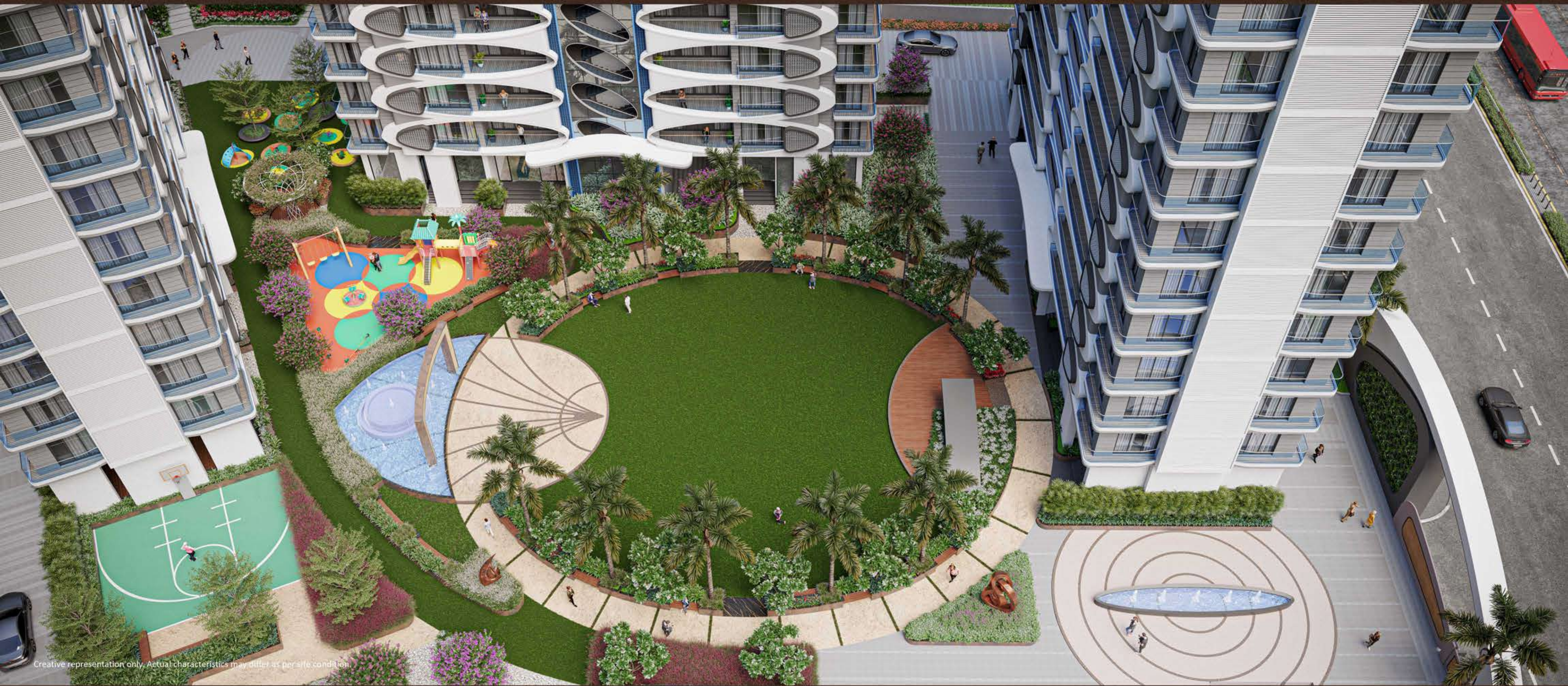
Creative representation only. Actual characteristics may differ as per site condition.